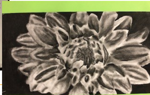
By Semaria Harvest